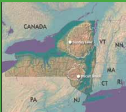
Adirondacks and Catskills outlined.