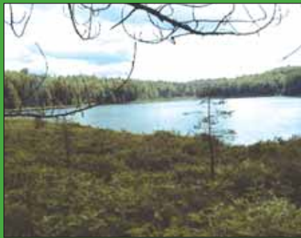
Sunday Lake